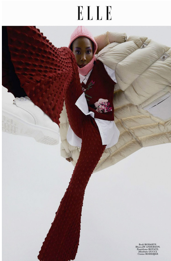
Modeli: IRENE C/O SPIN MODELS & LEANNE C/O CODE MODELS Kosa i šminka: SABINE HOEGERL C/O NINA KLEIN AGENCY Styljng: ANNE NEWMAN

HEIGHT 179 cm BUST/WAIST/HIPS 82/60/89 cm SIZE 34/36 JEANS 27/34 EYES brown HAIR black SHOES 40.5 LOCATION Hamburg DE